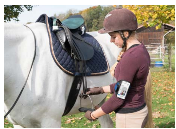
Preparation of load measurement before riding

The sensor mat consists of 6 sensors (3 for left and right side, each divided into frontal, medial, and posterior areas). Placed on the saddle, the sensor pad provides feedback regarding the rider's balance, symmetry, and stability while riding. The stirrup loadpad® measures the normal force exerted on the stirrups by the rider's left and right foot. The combination of the riders' loadpad® and the stirrup loadpad® enables precise monitoring of the rider's posture and balance.