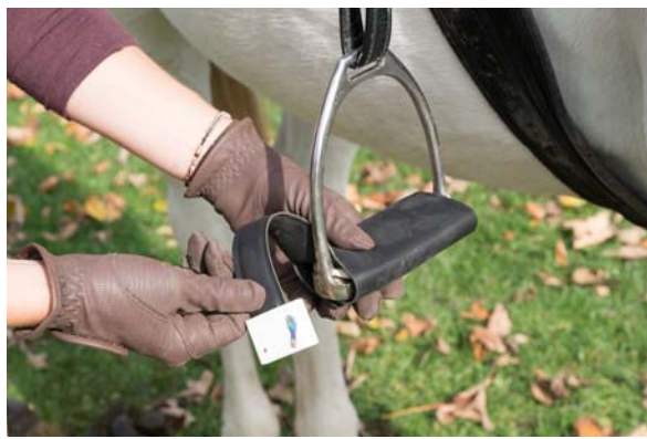
Fixation of the stirrup loadpad® sensor

With the help of real-time biofeedback the rider can immediately correct his or hers sitting position during riding. This system supports both the rider and the trainer in achieving a more harmonious riding position and obtaining a better understanding of the interaction between the rider, the saddle, and the horse.